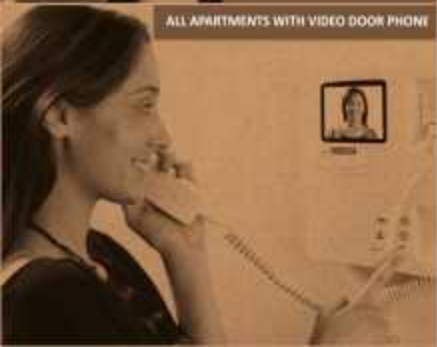
ALL APARTMENTS WITH VIDEO DOOR PHONE

" CROSS THE LIMITS " get the right opportunity