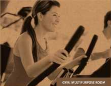
GYM, MULTIPURPOSE ROOM